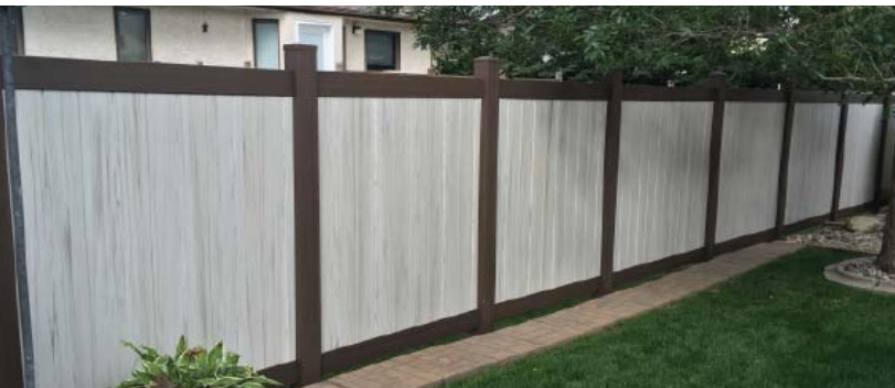
Weathered Aspen with Dark Walnut Accent